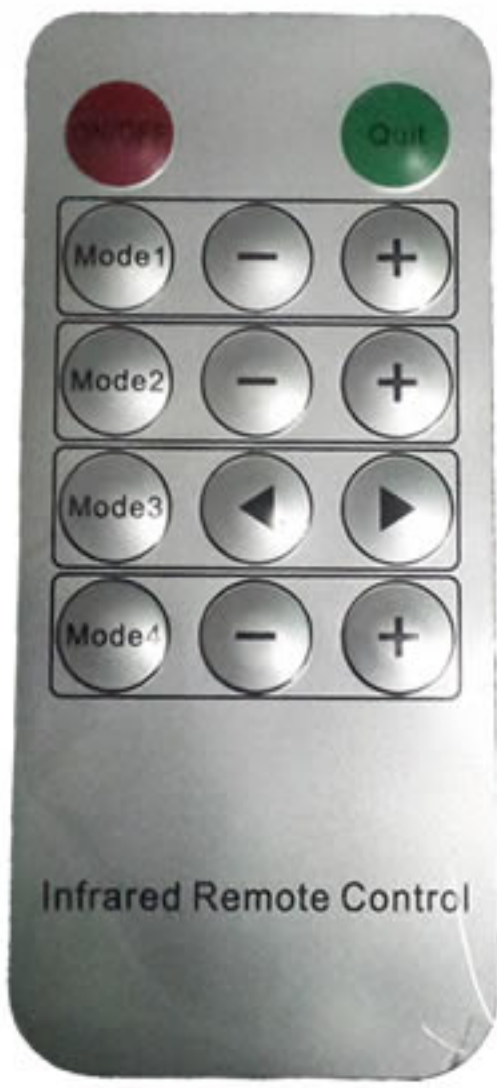
Infrared Remote Control