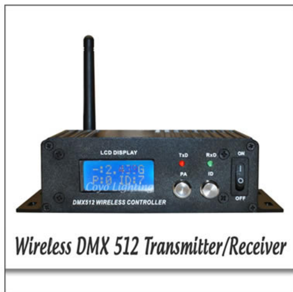
Wireless DMX 512 Transmitter/Receiver